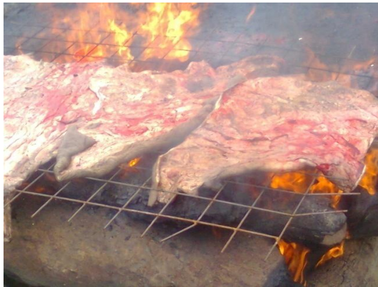
Figure 2. Hides placed on metal stripes during singeing.

capable of destroying the aquatic system; therefore, adequate monitoring should be done at abattoir levels to ensure that these waste are properly disposed. The potential risk of heavy metals bioaccumulation and toxicity may continue to increase in future depending on the extent of industrial influx into the environment due to man-made activities and abuses. At present, there are no set of maximum permissible levels for trace or toxic elements in hides in Nigeria; therefore, in order to protect public health and ensure food safety; it is recommended that maximum permissible levels for heavy metals in food of animal origin be established and reinforced in Nigeria.