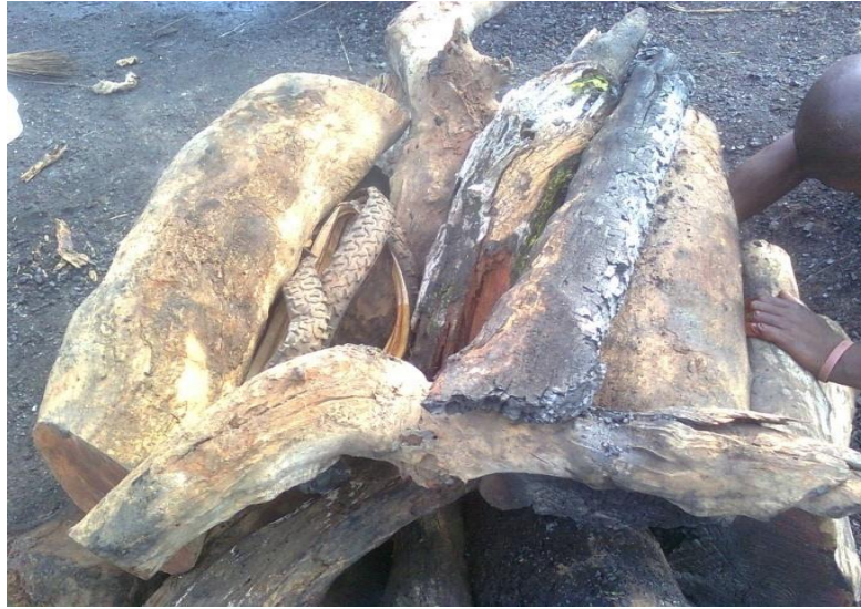
Figure 1. Tyre used to fuel wood for singeing.